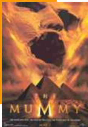
1999 Release "The Mummy"